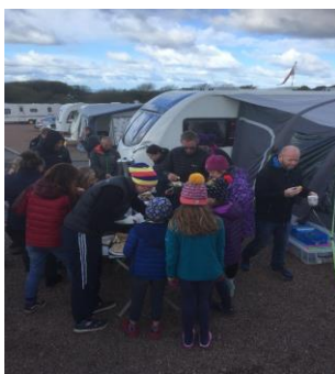
Twitcheen - Flagpole