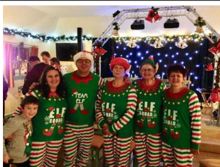
Hillhead, Team Elf