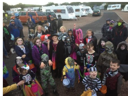
Twitcheen – Trick or Treat